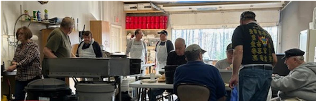
Volunteers cutting potatoes for the pot