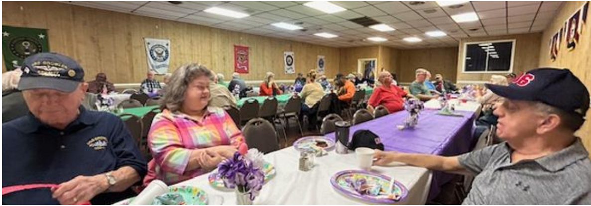
Things started to wind down as members and their families participated in small talk