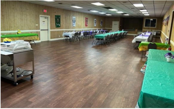
It was a rainy, cold morning but everything was ready for members and the Easter Bunny