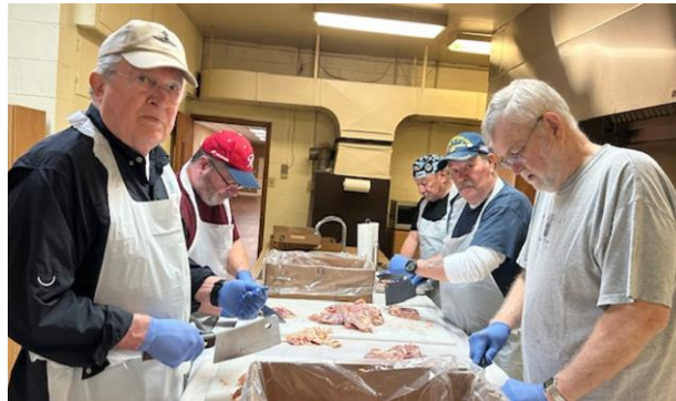
The chicken chopper hard at work

With cut potatoes in the pot and the beef & chicken cut up and ready for tomorrow, the cleanup was accomplished in no time. A few of the volunteers set things up for the very early start tomorrow.