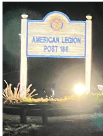
3am – Saturday

With cut potatoes in the pot and the beef & chicken cut up and ready for tomorrow, the cleanup was accomplished in no time. A few of the volunteers set things up for the very early start tomorrow.