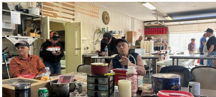
Waiting to spring into action!

Everyone waited for the final cooking process