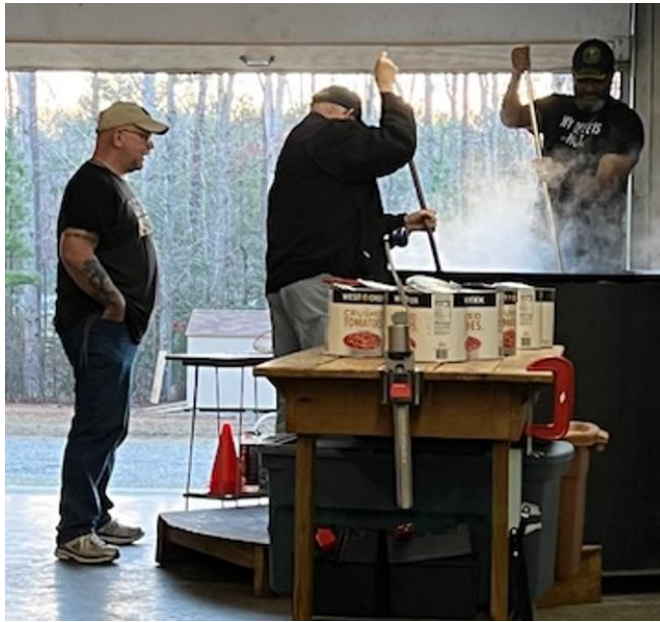
Let the stirring begin. Getting ready for the tomatoes

Fortunately there were enough volunteers to rotate those individuals doing the stirring. It's not an easy task standing and stirring for any length of time