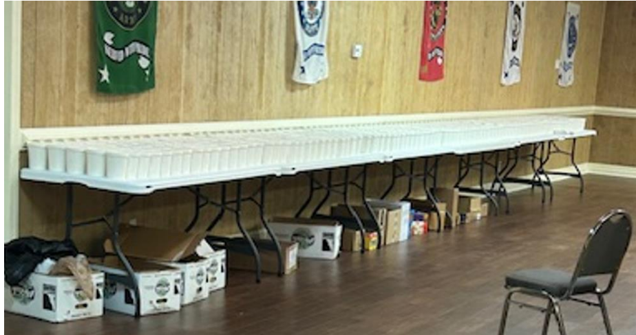
507 quarts of stew ready for pick up!

The entire process went smoothly thanks to the many volunteers that showed up both days to help. Everyone commented on how much fun they had, even though at times, things got hectic.