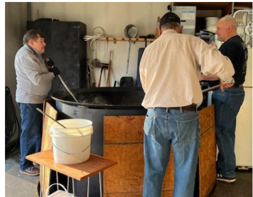
"Double, double toil and trouble: Fire burn, and cauldron bubble."

Everyone waited for the final cooking process