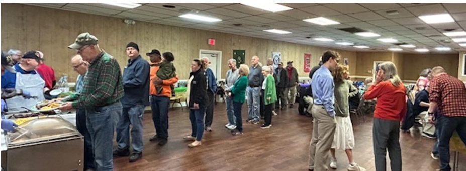
Eager crowd ready for breakfast

Then he arrived, the Guest of Honor, the Bunny himself – the Easter Bunny