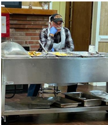
The lone server trying to stay awake after a long morning