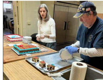
Celebrating the American Legion's Birthday