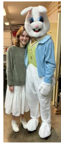
Even the adults enjoyed seeing the Easter Bunny