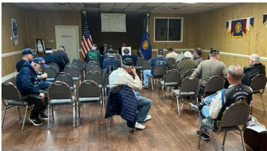
Listening to the various reports.

Things were fairly routine on an evening well attended. The Commander, again, stressed the need for more participation from the membership. As the current workforce ages, the Post needs more members to step up whenever and where ever they can.