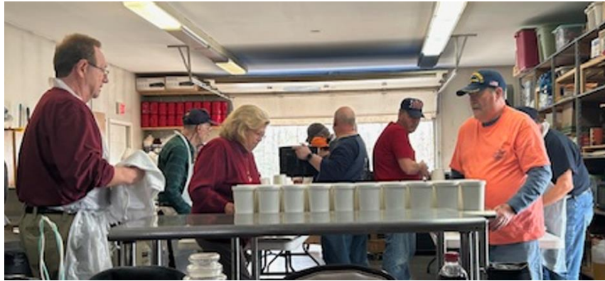
75 filled containers are placed on the cart and moved to the Meeting room